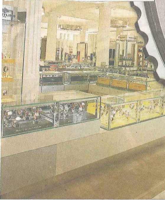
Breitling Navitimer steel on crocodile strap, £4,110, available at Harrods and Selfridges

atch retailing utique rmerly Hong s. Instilled Osqm store some of the brand's five uatimer dive hed scuba cked with Spitfires to